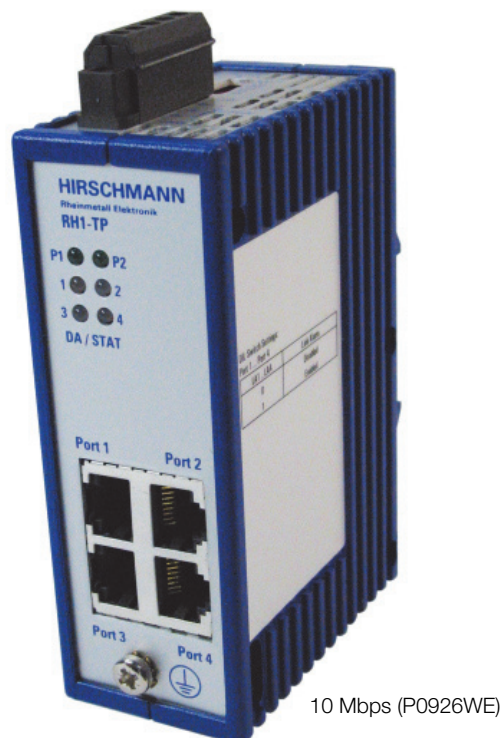
10 Mbps (P0926WE)

The 4-Port 10 Mbps Industrial Hubs are DIN rail mounted and support 10 Mbps Ethernet protocol to/from devices that communicate at speeds of 10 Mbps. You can connect up to three dual-ported Ethernet devices, using a pair of hubs, to a redundant FBM233. Multiple hubs can be interconnected to connect up to 64 devices to the FBM233.