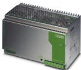
DIN rail power supply unit 24 V DC/40 A, primary switched-mode, 3-phase.

Please be informed that the data shown in this PDF Document is generated from our Online Catalog. Please find the complete data in the user's documentation. Our General Terms of Use for Downloads are valid ( http://phoenixcontact.com/download )