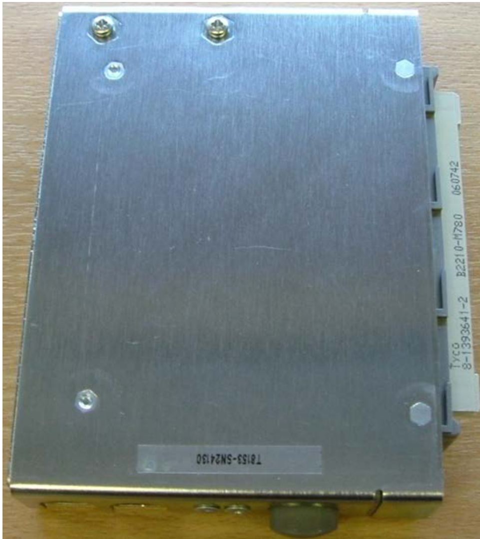
Figure 1 T8153 Photo

The Trusted Communication Interface Adapter T8153 is designed to be connected directly to the rear of a Trusted Communication Interface Module in a Trusted Controller Chassis T8100. The Assembly provides a communications connection interface to remote systems. Connection between the Assembly and the Trusted Communication Interface module is via a 78+2-way Inverse DIN41612 M-type connector (SK1).