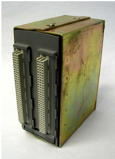
Figure 5-8 Expander Interface Adapter (Front View)

With the controller chassis dip switches set to ID #1, the first seven expander chassis would have their dip switch ID #s set from 2 to 8. Another interface adapter would be used to connect to the next seven chassis. Those chassis also need their dip switch ID #s set from 2 to 8, although they would be designated 9 to 15 in the software configuration (.ini file) described in Section 8.