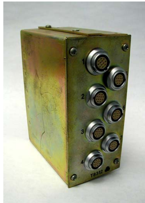
Figure 5-9 Expander Interface Adapter (Rear View)