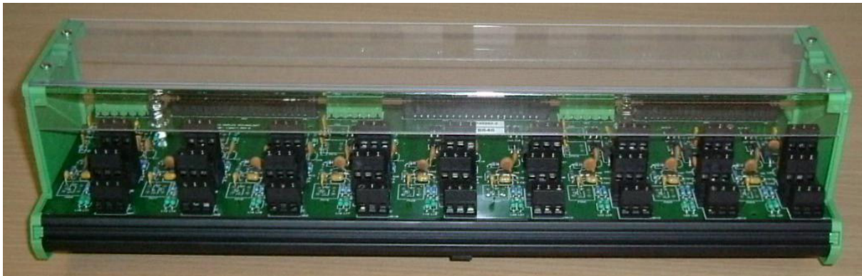
Figure 1 T8846 Module Photo

The T8846 Speed Input Field Termination Assembly (SIFTA) is an integral part of the overall T8442 Speed monitor system. It is DIN rail mounted, containing passive signal conditioning, power distribution and protection components.