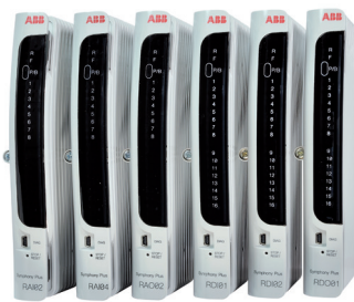
SD Series Redundant I/O