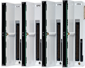
HBS01-XXX and VBS01-XXX