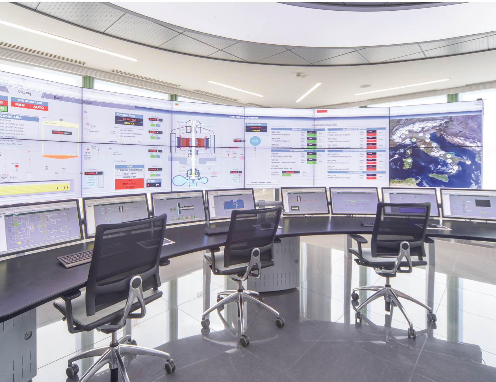
ABB Ability™ Symphony® Plus