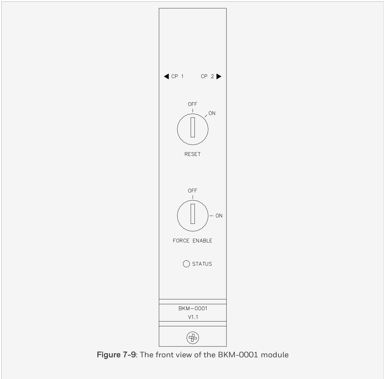
Figure 7-9: The front view of the BKM-0001 module

The BKM-0001 module may be placed or removed in a running system. The application program will not be interrupted by these actions.